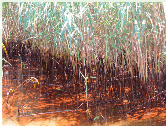
An oiled marsh in Pass a Loutre, Louisiana in May 2010.