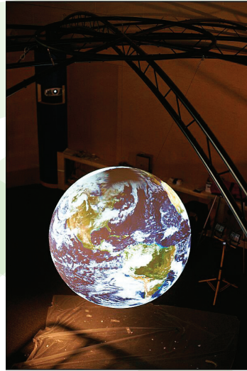
NOAA Science on a Sphere installation at the Science Museum of Virginia. This sphere is one of 11 located in NOAA's North Atlantic Region.

To learn more about the project and project partners, check out http://www.neosec.org/projects/families-by-the-seaside