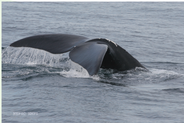
An endangered right whale in the waters off New England.